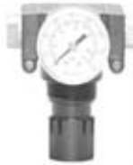
R10M & R11M

Port Size: 1/8" 1/4" (A=3.0 (1.7 no port), B=3.0 (2.6 no port), C=0.5)